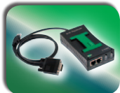
Digi Passport® I-KVM