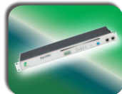
Digi Remote Power Manager