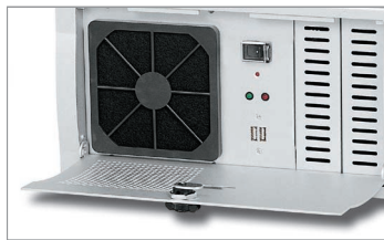
Plastic Fan Filter For easy cleaning and exchange